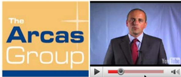
Embedded video "sales pitch"

The Arcas Group 5200 Deerlake Drive Alpharetta, Georgia 30005-3601 USA Phone: 404-496-4136 Fax: 404-496-4418 URL: www.thearcasgroup.com Email: info@thearcasgroup.com